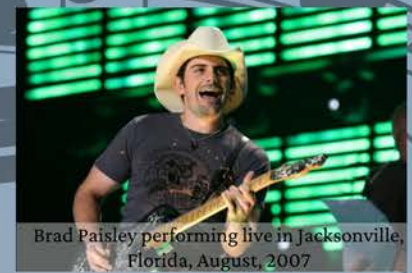
Brad Paisley performing live in Jacksonville, Florida, August, 2007

In 1999, country singer Brad Paisley released his first album, Who Needs Pictures . It was quickly met with critical acclaim, and Paisley was well on his way to stardom, receiving numerous accolades that year. He has created compelling country music for over two decades that has redefined the genre, earning him several Grammy Awards, dozens of chart-topping singles, and selling over 11 million albums. His rapid rise to fame came seemingly from nowhere but was, in truth, the result of relentless study, practice, and experience that began when Paisley was a young boy.