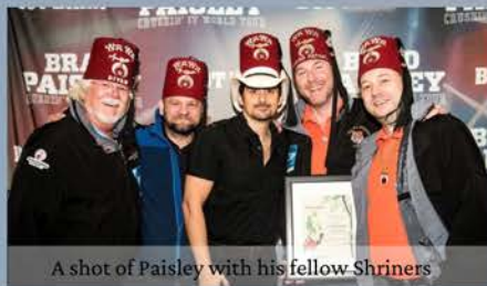
A shot of Paisley with his fellow Shriners

He has toured the country nearly 20 times as a headliner and opening act. Brad has also written songs for Pixar's Cars franchise, including "Behind the Clouds," "Find Yourself," "Collision of Worlds," "Nobody's Fool," and more. Paisley has also written two books, including the 2003 release Jug Fishing for Greazy and Other Brad Paisley Fishing Stories . In 2011, he published his autobiography Diary of a Player: How My Musical Heroes Made a Guitar Man Out of Me , which catalogues his early life and career in music.